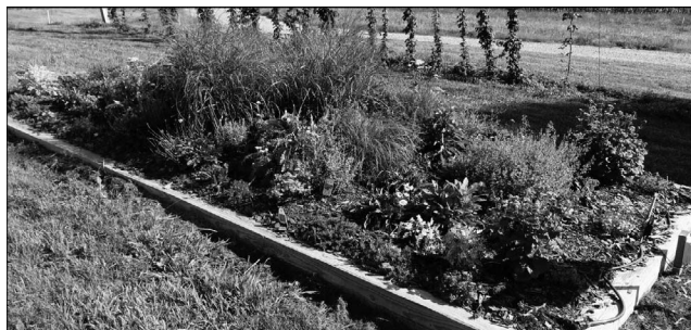
Fig. 1. Landscape bed at the Mountain Horticultural Crops Research and Extension Center (MHCREC) in Mills River, NC. Bed was divided evenly into four rectangular quadrants, each containing a single replicate plant.

whether healthy-appearing plants harbored any species of Phytophthora . Due to funding shortages, this was not performed in 2019.